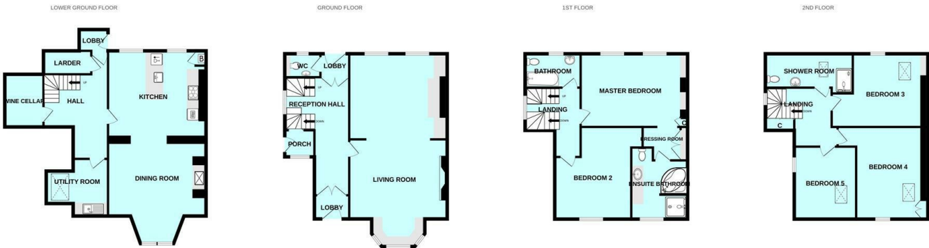
Made with Metropix ©2024

Please contact our Plymouth Office on 01752 664125 if you wish to arrange a viewing appointment for this property or require further information.